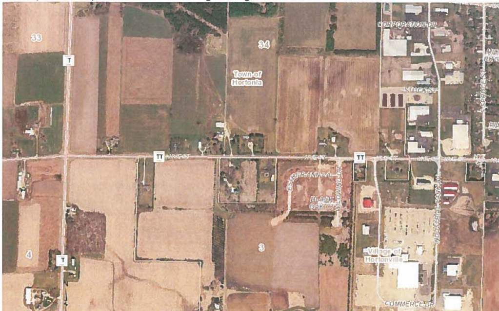
Aerial overview of subject corridor

This segment is a 2-lane rural highway with 12-foot paved lanes and 4-foot gravel shoulders. An all-way stop exists at CTH T. The most recent Wisconsin DOT traffic count shows an AADT of 1,300 east of CTH T. CTH TT has approximately 16 access points in this segment of roadway. Over the past several years development has slowly progressed west with Hortonville annexing large tracts of land. One new subdivision to note is being built on the south side of the highway about 1/2 mile east of CTH T. Development is expected to continue along this segment of CTH TT.